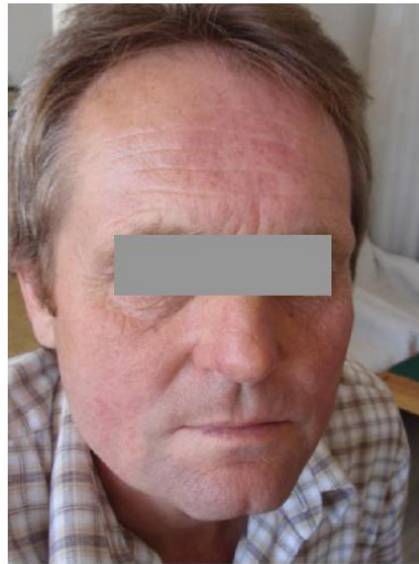
Figure1. The patient before isotretinoin treatment

central necrosis and were surrounded by a dense lymphocytic infiltrate (fig. 3, 4). The diagnosis of GR was established. Next, an ophthalmological investigation was carried out, and ocular rosacea was excluded. A retinoid therapy was decided on. The laboratory tests were within normal limits except for slightly elevated low fraction of cholesterol (2,66 mmol/ l). Informed consent was signed and isotretinoin therapy at a dose of 0,3 mg/kg body weight per day was begun. Follow-up visits were chosen on monthly basis. There was a rapid therapeutic response with significant improvement (reduction of the papules in size) within one month (fig. 5). Four months later the papules completely disappeared. Isotretinoin was given at the total dose of 70 mg/ kg body weight (for six months). No side effects except for slight cheilitis and xerophthalmia, and insignificantly elevated low fraction of cholesterol (3,36 mmol/l at the maximum) were recorded. At the end of the isotretinoin treatment, only small redness and slight teleangiectasias on the nose and cheeks were still present (fig. 6). The patient is still in a follow-up of our Acne Clinic, he is very happy with his appearance. He is applying a local cream containing azelaic acid by now (as a maintenance therapy) and trying to avoid triggering factors of rosacea. The patient is regularly checked-up by an ophthalmologist.