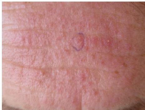
Figure2. The patient before isotretinoin treatment (a detail)