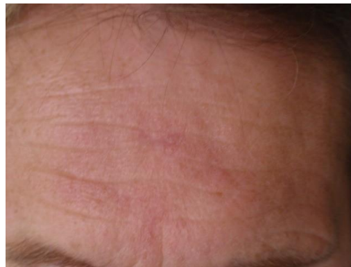
Figure5. The patient after one month of isotretinoin treatment