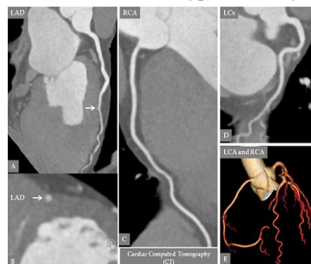
Figure1. Cardiac computed tomography (CT) reveals normal coronary arteries and the absence of atherosclerotic changes (A, C, D, E). The LAD has a short segment with myocardial bridging (A and B white arrow). LCx, left circumflex artery; LAD, left anterior descending artery; RCA, right coronary artery

Consequently, non-invasive cardiac CT could be utilized as an appropriate diagnostic tool instead of invasive CAG in the following circumstances: 1) when the suspicion of acute coronary syndrome is low as in the current case or the patient refuses invasive diagnostic assessment; 2) in suspected recurrent TS; 3) in patients with elevation of myocardial infarction biomarkers during acute critical illnesses such as sepsis, intracranial diseases (e.g subarachnoid hemorrhage, ischemic stroke) and other critical conditions that may be complicated by TS; 4) in patients with bad echocardiographic acoustic windows and contraindications to CMR imaging; and in 5) patients with delayed presentation after an episode of chest pain or for a retrospective evaluation of a patient with the typical history of TS weeks before.