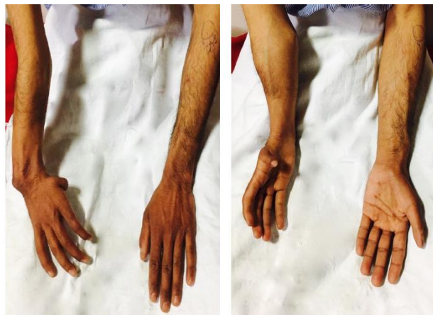
Figure 1& 2. Right arm is foreshortened with underdeveloped thumb, metacarpals and radius. Abnormality becomes obvious when palms are supinated

A 24-year male presented with history of central cyanosis since early childhood. Patient denied any history of any recurrent respiratory tract infections and delayed growth milestones. On examination there was right upper limb abnormality in the form of foreshortened arm, underdeveloped small sized thumb and there was difficulty in apposition of thumb to fingertips. Metacarpals and right radius was underdeveloped. (Fig.1 and 2) ECG revealed left axis deviation, broad notched P wave with biventricular hypertrophy. Chest X-ray showed a normal sized heart with decreased pulmonary vascularity and a concave pulmonary arterial segment. Echocardiography showed complete atrioventricular septal defect (AVSD) (Fig. 3) with pulmonary stenosis (PS). A complete Diagnosis of Holt Oram syndrome (HOS) with AVSD with PS was made. Patient underwent successful intracardiac repair.