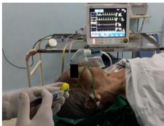
Figure3. Postoperative analgesia delivered through the catheter.