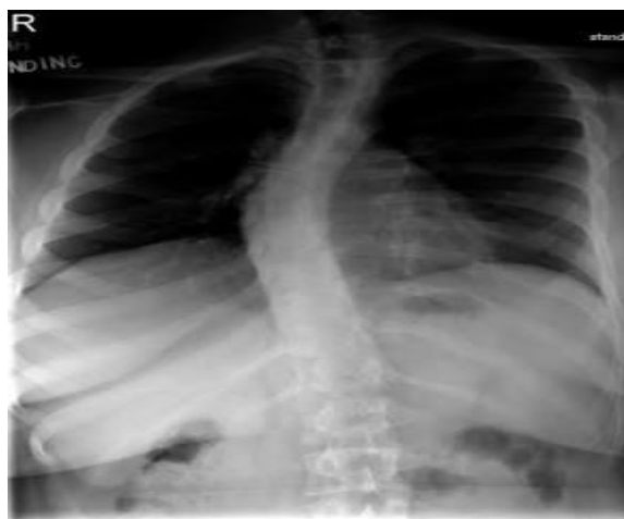
Figure1. X-ray chest showing kyphoscoliosis of thoracic spine.