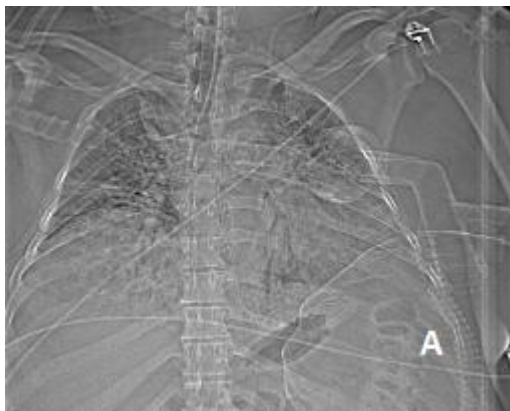
Figure 5. Chest X ray after VV-ECMO cannulae removing

Two weeks after the dual cannulation of VV-ECMO, a chest X-ray revealed significant improvement (Figure 5). Gradual weaning from ECMO support was started during the third week. The tracheostomy was not performed in order to decrease bleeding, infection and cruel maneuver in complex patient.