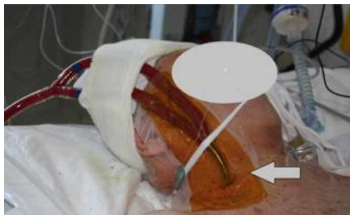
Figure3. Image of single cannulae VV-ECMO, the site of insertion is highlighted by grey arrow.

ml·Kg -1 ·min -1 (set up on Height 180 cm and weight 130 Kg), air flow 8 lt/min and FiO 2 0.9. The perfusionists checked pressure drop and gas exchanges of the oxygenator every 12 hours. The Gases after VV-ECMO were get better (pH 7.41, PCO 2 35.3, PO 2 41.4, SVO 2 73.3, Hb 11.8).