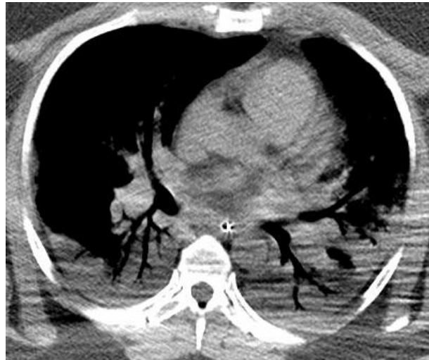
Figure1. Computed tomography, short-axis view of lung effusion and acute respiratory distress syndrome at the control after the transfer from secondary hospital