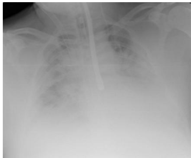
Figure2. Chest X ray control of single cannulae VV-ECMO implantation.

Due to the cultural results, an antiviral therapy was administered consisting in oseltamivir (orally) and zanamivir (via aerosolization) for ten days, in addition to the piperacillin-tazobactam and clarithromycine (empirical therapy started in the suspicious of community-acquired pneumonia). Methylprednisolone was administered at the dosage of 1mg/Kg bolus, followed by continuous infusion of 1 mg/Kg/day in order to induce down-regulation of systemic inflammation, improve pulmonary and extrapulmonary organ dysfunction (2). No muscle relaxants were administered.