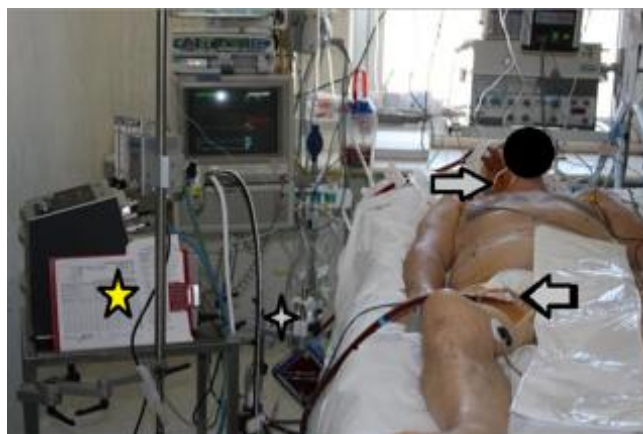
Figure4. Switch from single to double venous cannulation with a Medtronic 21Fr (Minneapolis MN) cannula into the right femoral vein (lower grey arrow) and Avalon Elite DLC pulling back from the inferior vena cava until the right atrium (upper grey arrow). The console (yellow star) and oxygenator (yellow asterisk) of ECMO was on the right of patient.

With the conversion from single to dual cannulation, the venous blood was drawn from the inferior vena cava through the new femoral cannulae and oxygenated blood returned to the right atrium through the pre-existing Avalon Elite DLC (Figure 4).